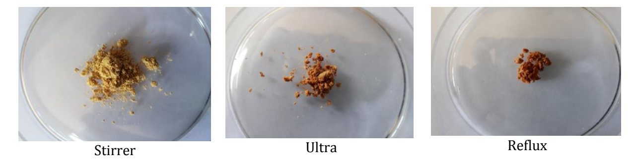
Figure 1. Images of curcumin-hydrazine reaction products under different reaction conditions